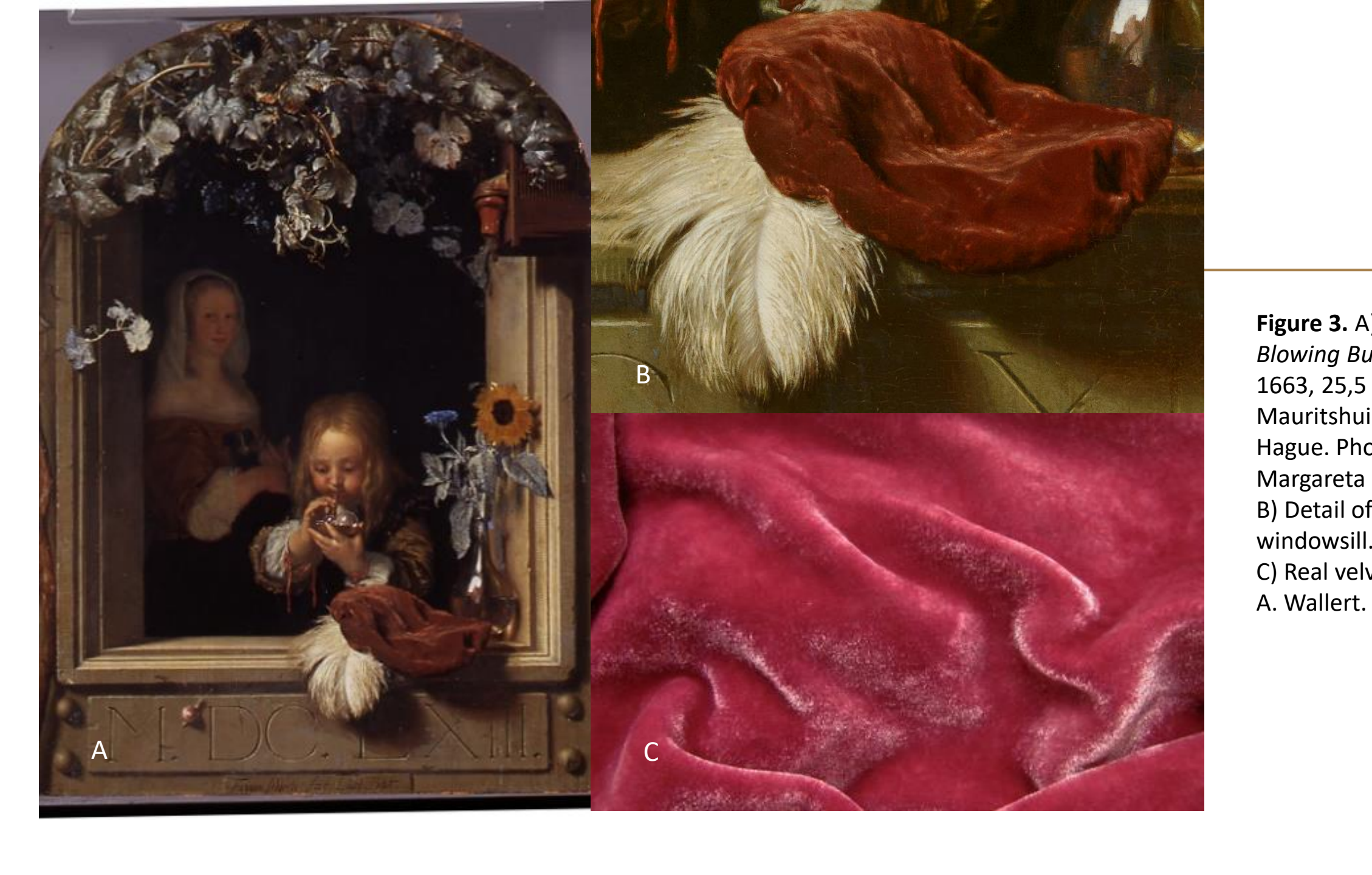
Figure 3. A) Boy Blowing Bubbles, 1663, 25,5 × 19 cm. Mauritshuis, The Hague. Photo Margareta Svensson. B) Detail of hat on windowsill. C) Real velvet. Photo