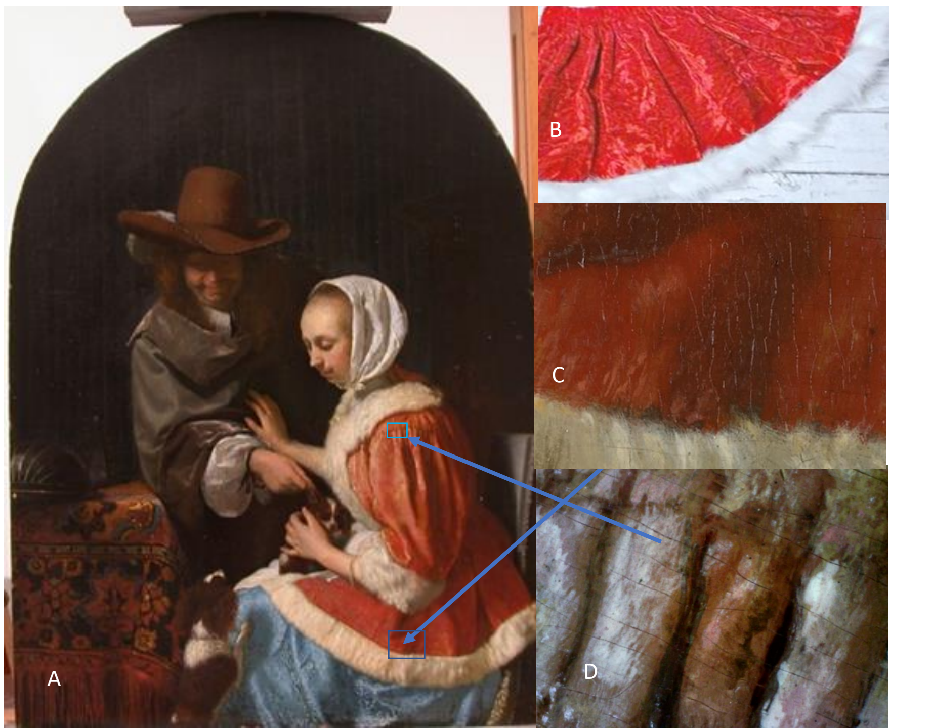
Figure 2. A) Frans van Mieris, Man and Woman with Two Dogs, 1660, panel, 27,5 × 20 cm, Mauritshuis, The Hague.