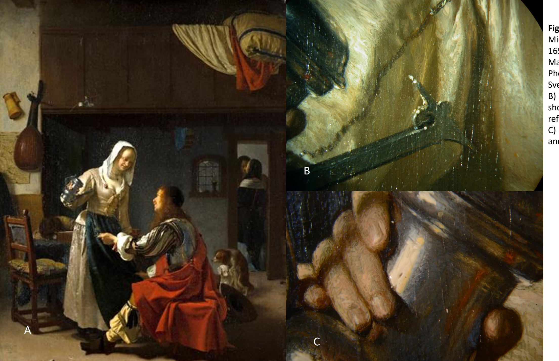
Figure 4. A) Frans van Mieris, Brothel Scene, c. 1658, 42,8 × 33,3 cm, Mauritshuis, The Hague.